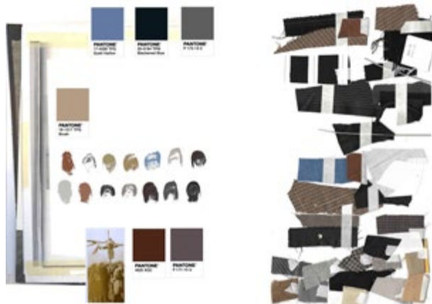
Laia Canales | Angerri